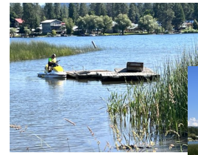
Dock demos in June & August

We want to give a heartfelt thank you to those of you who did send us a check to help with these costs, however, this year donations and fees total $2,500, which will not even come close to covering the costs. The use of everyone's dues to pay for the removal of an individual property