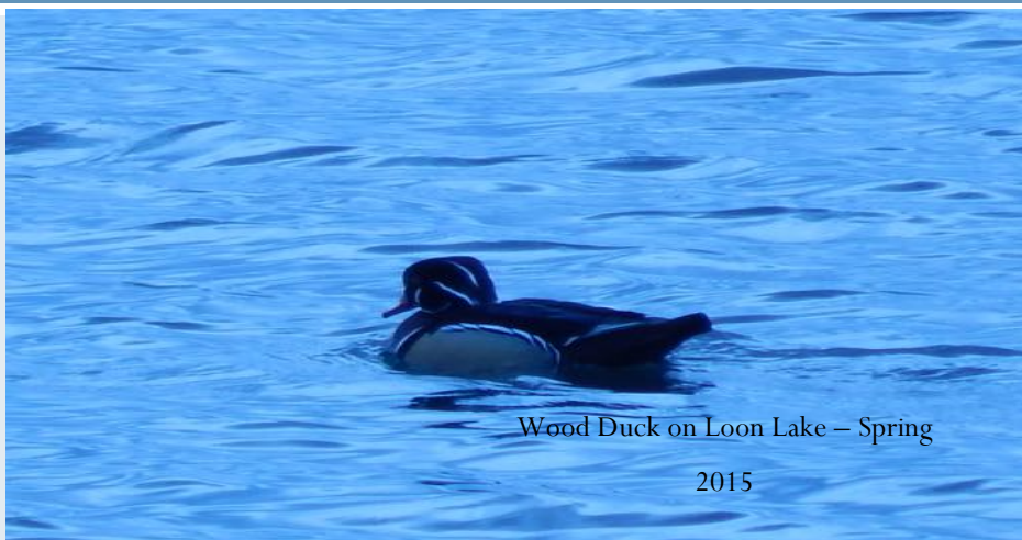
Wood Duck on Loon Lake – Spring 2015