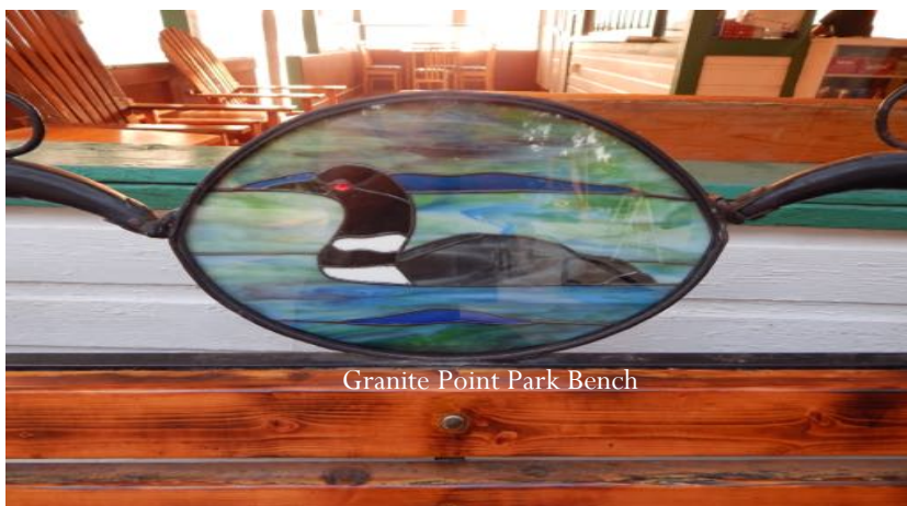
Granite Point Park Bench

2 – Loon is classified by WA ST law as a “lake of statewide significance.” Though the State's usage priorities don't include usage by property owners, or the