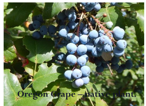
Oregon Grape – native plant.

LOON LAKE PROPERTY OWNERS ASSOCIATION – LLPOA – We have a purpose ~ To organize the property owners within and adjacent to the shores of Loon Lake Stevens County Washington. To protect Loon Lake from environmental degradation. To provide a forum by which the property owners may assist governmental agencies in better planning the use and resources of the Loon Lake Area.