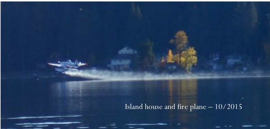
Island house and fire plane – 10/2015