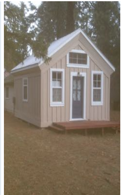
One of the original cabins that was built in the Morgan Park Area. It is still standing.